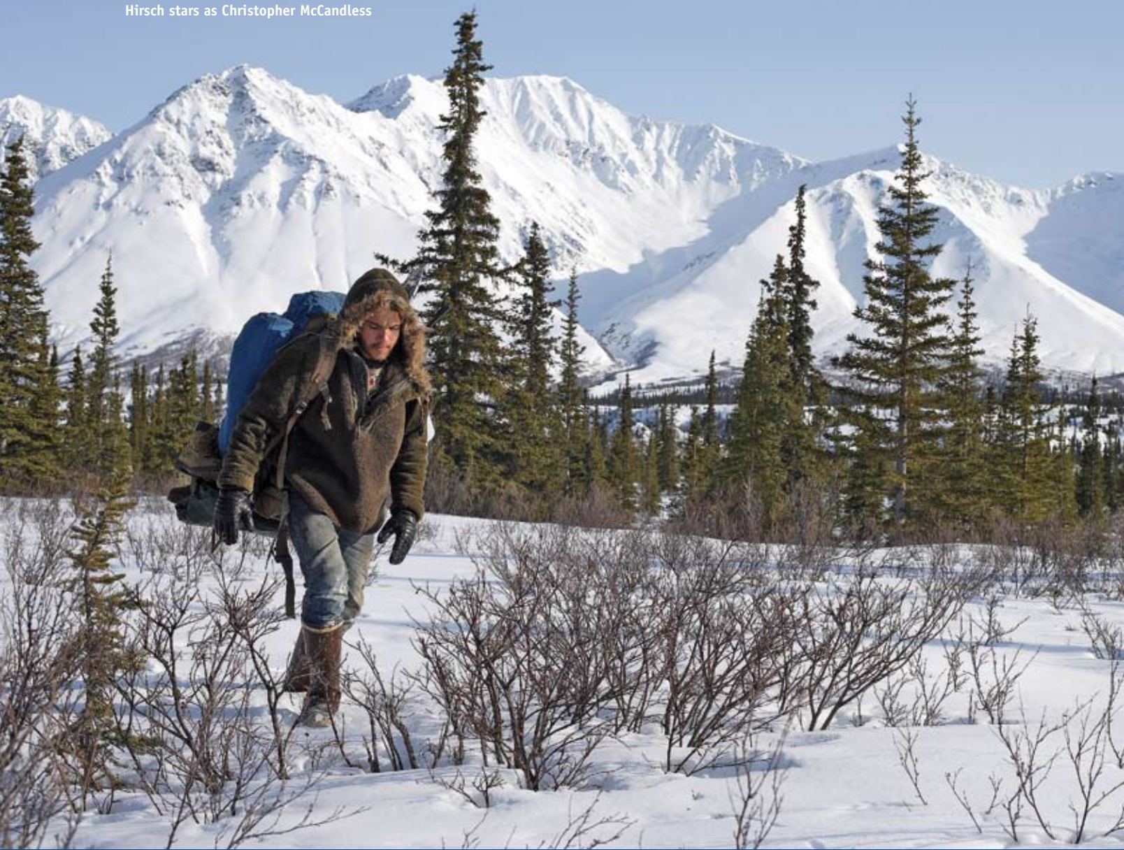
Hirsch stars as Christopher McCandless

Though an Oscar®-winning actor and the son of director Leo Penn and actress Eileen Ryan, Sean Penn has never seemed comfortable with movie stardom or the Hollywood scene. He doesn't go out of his way to court the press or the public. He doesn't make light comedies or superhero movies to keep his profile—and his quote—high. He wears his politics on his sleeve, and if the resulting talk-radio hostility bothers him, he's not showing it.