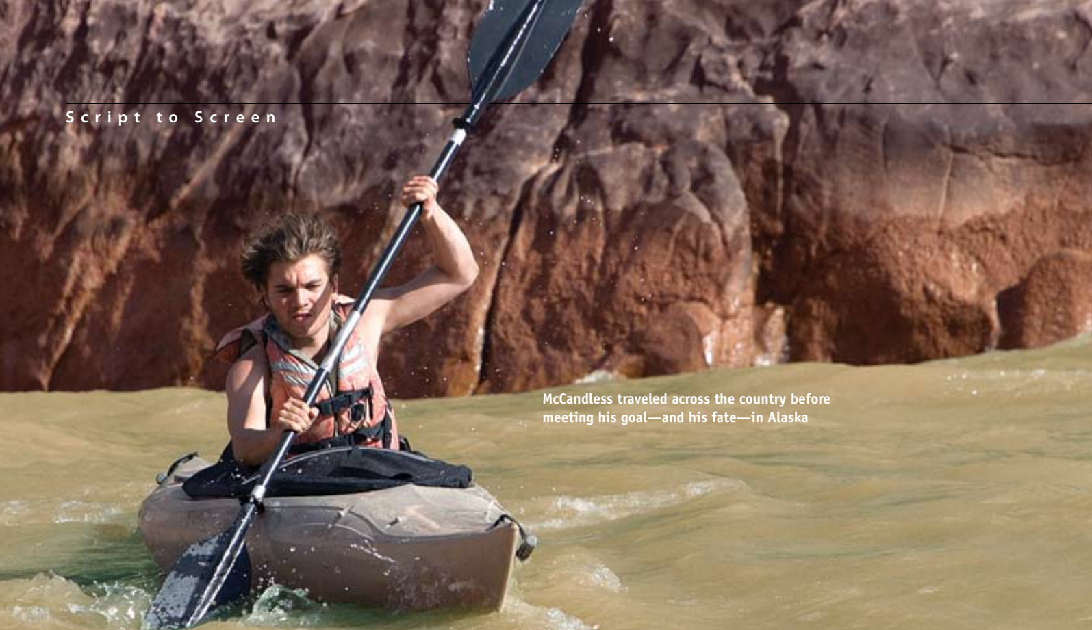
McCandless traveled across the country before meeting his goal—and his fate—in Alaska

he says, is about seeing McCandless' journey as a rite of passage. Though some parts of the story are about how people react to trauma, he says, "The lion's share of what Jon and I responded to came from a wanderlust I think is universal, but to varying degrees. And a rite