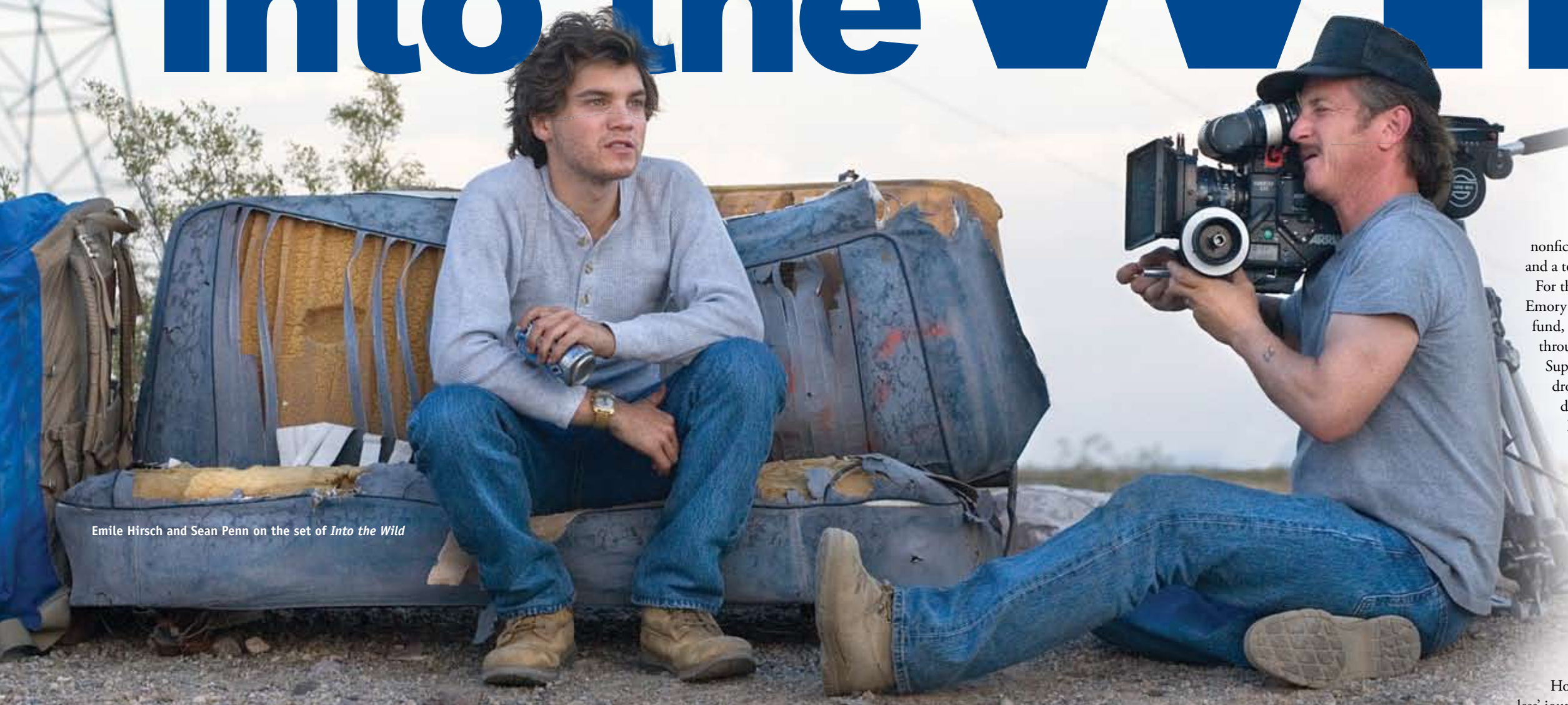
Emile Hirsch and Sean Penn on the set of Into the Wild